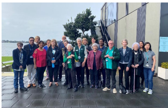
North Shore celebration

The Patient Experience team celebrated National Volunteer Week with our amazing volunteers on Thursday 22 June at Waitākere Hospital and Friday 23 June at North Shore Hospital. The volunteers appreciated enjoying a meal and sharing experiences with volunteers from different roles, wards and services.