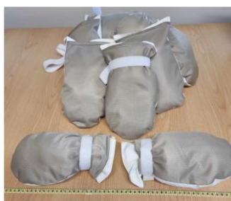
New version of padded mitts

For the month of June, Hospital Auxiliary donated over 1,400 items to patients and families at both hospitals (355 to Waitākere and 1,061 to North Shore). These items included 400 sleep packs, new version of padded mitts, adult fleece caps etc. These items are in addition to their usual donations of blankets, caps and baby items.