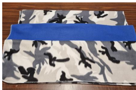
Adult's fleece scarves