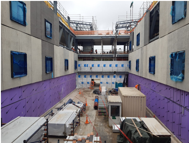
Pictured: the building's interior atrium - currently home to construction materials!

The atrium steel roof is the final part of the exterior structure to be completed and construction will begin shortly.