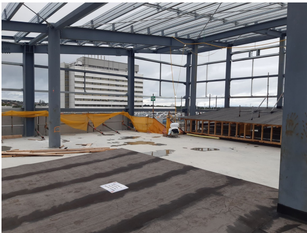
Pictured: a view from the roof to neighbouring North Shore Hospital.

The panels come with the windows already in place and there's now a real sense of what our four-level hospital building will look like upon completion of construction in 2023.