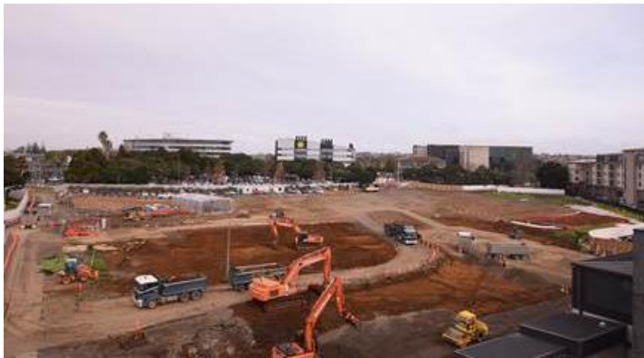
Earthworks have started on the build site

Work is continuing to progress on the build site. Redundant in-ground services have now been removed and earthworks and preliminary drilling works are now underway. The site is currently 97% asbestos-free, with this last section of affected material to be removed by the end of July. Phase one of the Hawkins site establishment plan has now been completed.