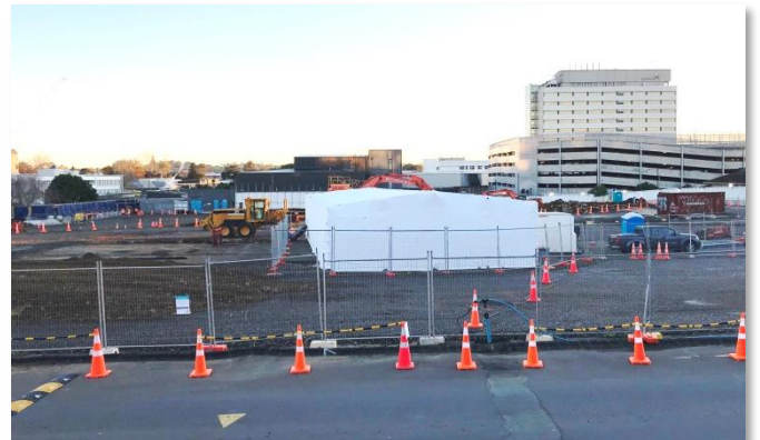
Final area of asbestos being cleared under the tent