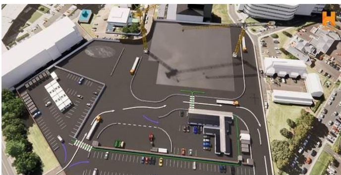
Build site layout