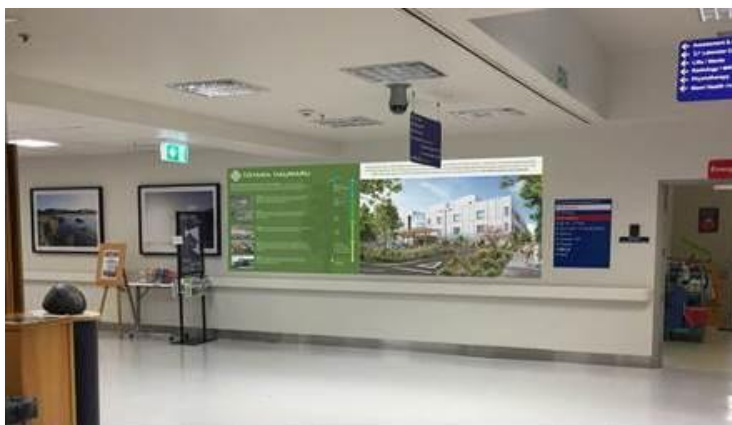
Proposed location inside North Shore Hospital

Wall graphics will shortly be placed inside the front entrance to North Shore Hospital and along the fence line on Taharoto Road to give the public details about the project and the benefits it will bring.