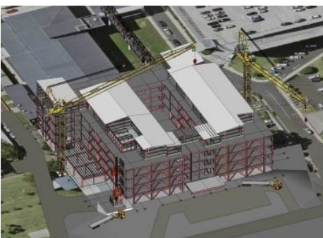
Schematics of tower cranes in relation to the hospital building