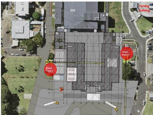
Locations of both cranes in relation to build site

Construction on the second tower crane has started and it should be in place within the next two weeks.