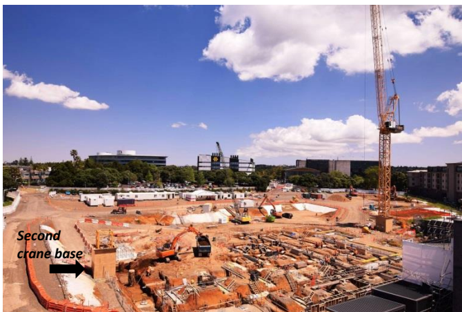
Building site at present – second crane being built in the lower left of the image