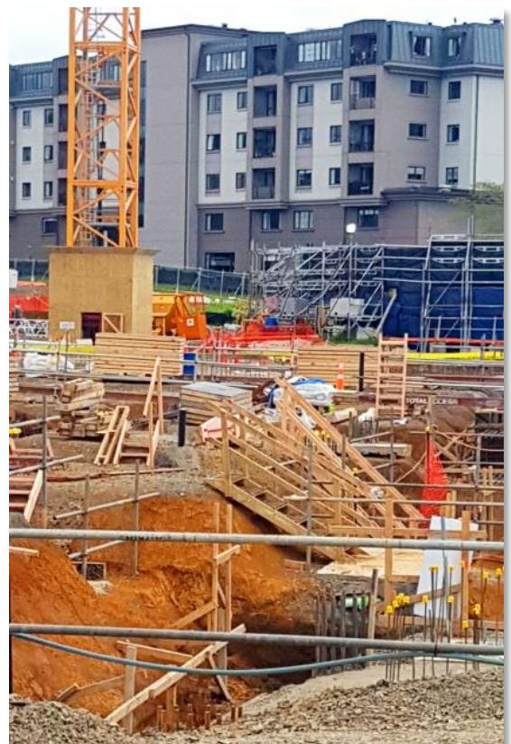
Foundations being dug