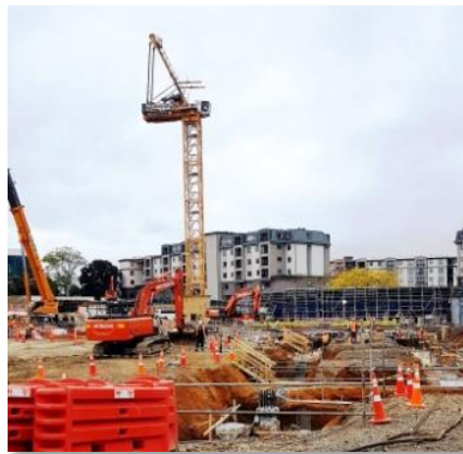
First crane under construction on-site