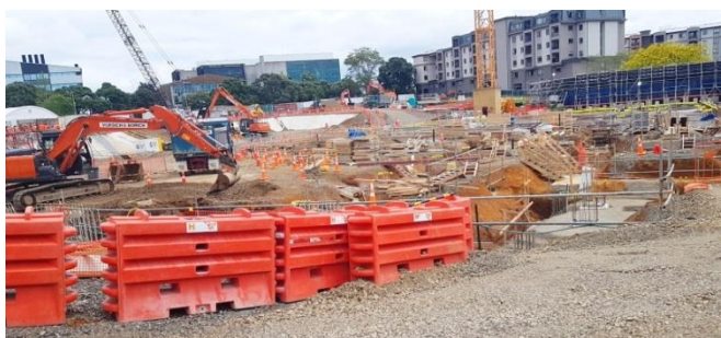
Work underway on-site