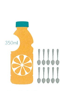
fruit juice 10 teaspoons of sugar