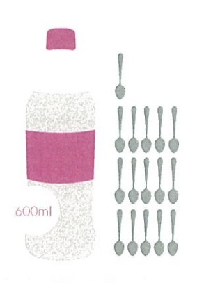
soft drinks 16 teaspoons of sugar