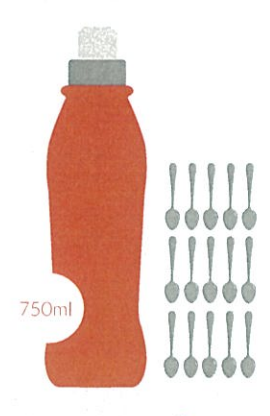
sports drinks 15 teaspoons of sugar